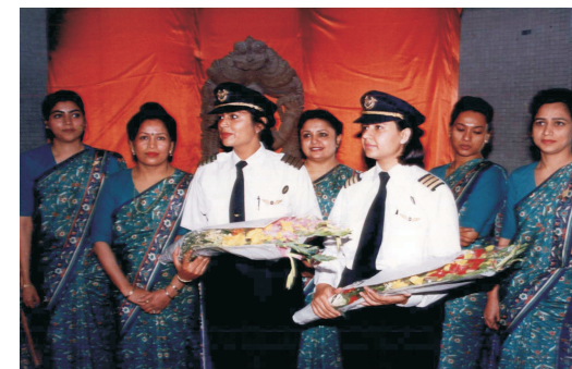
All women crew

A separate common room has been earmarked for women for attending to their needs for medical emergency/rest. Problems of the women employees as and when reported, are promptly attended to and resolved amicably, keeping in view specific requirements of Government Policy on the subject. As a part of modernization of work procedures, women employees of the Bureau are also being imparted computer training as well as in use of other modern office automation equipment.